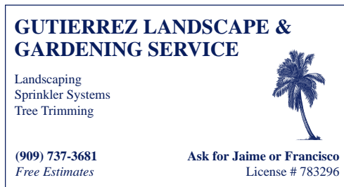
Design Principle: Alignment