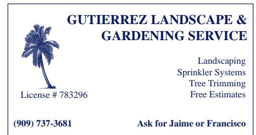
Design Principle: Proximity