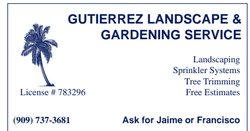
Design Principle: Contrast